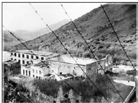
Radni zatovr Madaganskaja (1930-1950)

Umjesto zaključka dovoljno je prenijeti vijest iz ruskog časopisa Pravitel'stvennyj Vestnik (№ 7, 1990) prevedenu na engleski jezik: "... from 1930 to 1953 years on charges of counterrevolutionary crimes courts and all sorts of non-judicial bodies has ... convicted 3.778.234 persons, of whom sentenced to capital punishment - shot - 786.098 people..." [... u vremenu od 1930. do 1950. pod optužbama za kontrarevolucionarne zločine sudovi i razna ne-sudska tijela osudili su 3.778.234, a od tog broja na smrt 786.098 ljudi ...].