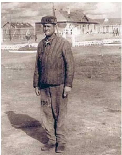
Geolog-logoraš br. 138 u logoru u Vorkuti 1946.