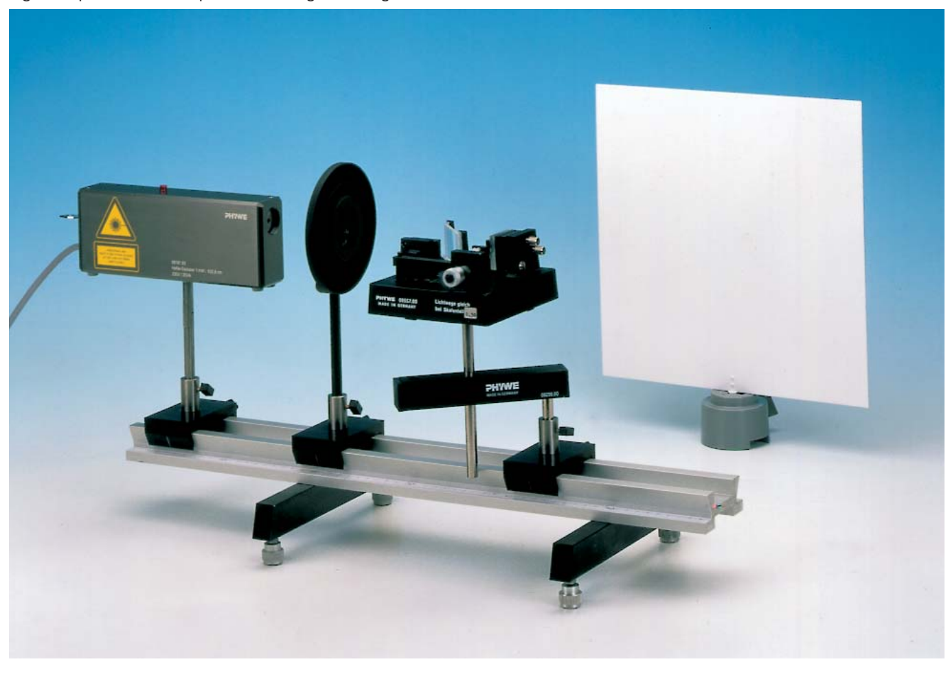
Fig. 1: Experimental set-up for measuring wavelengths with the Michelson interferometer.

Caution: Never look directly into a non attenuated laser beam