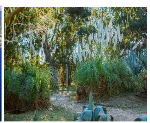
Return to the hotel for dinner and overnight.