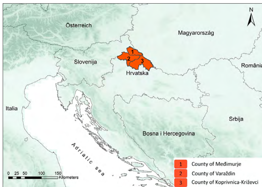
Figure 1. Analysed area of research

Varaždin-Koprivnica Region is a part of NUTS-2 Northern Croatia region, which covers three NUTS-3 regions: County of Varaždin, County of Međimurje and County of Koprivnica-Križevci (Fig. 1). The river Drava is the skeleton of that region. The region is located near the Hungarian and Slovenian border, and at the same time in the vicinity of Austria. Good traffic connection with the listed countries and the capital city Zagreb as well as the tradition of entrepreneurship and manufacture (Savić et al., 2021) had a positive impact on its economic development. In 2021, the population of the region was 365,958 (9.5% of Croatian population) in the area of 3,732 km 2 (6.6% area of Croatia). 9.2% of the employed people in Croatia are concentrated there (CBS, 2022).